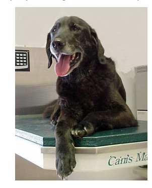
Persistent Cough Difficulty Chewing Excessive panting